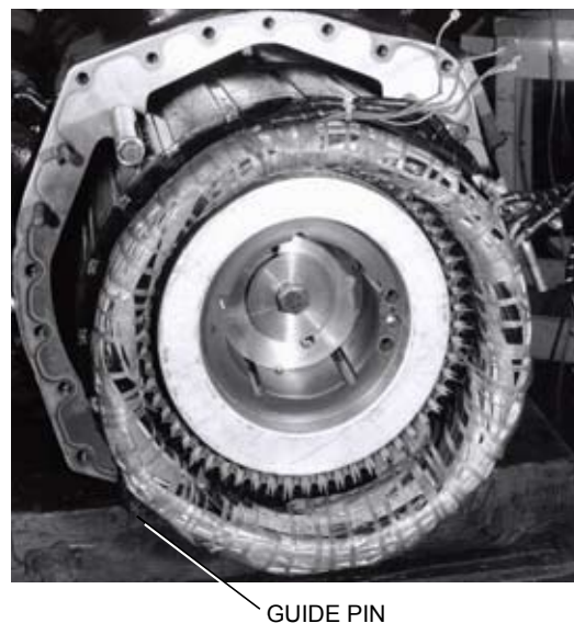
FIG. 44B – REMOVING THE STATOR (Horizontally)