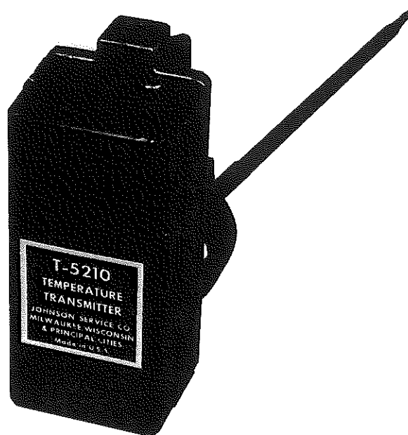
FIG. 9 – LOW WATER TEMPERATURE TRANSMITTER PNEUMATIC PRV CONTROL UNITS ONLY