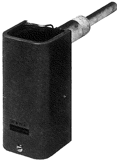
FIG. 7 – LOW WATER TEMPERATURE THERMOSTAT