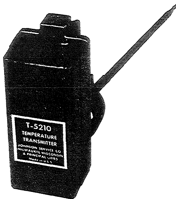
FIG. 8— LOW WATER TEMPERATURE TRANSMITTER PNEUMATIC PRV CONTROL UNITS ONLY