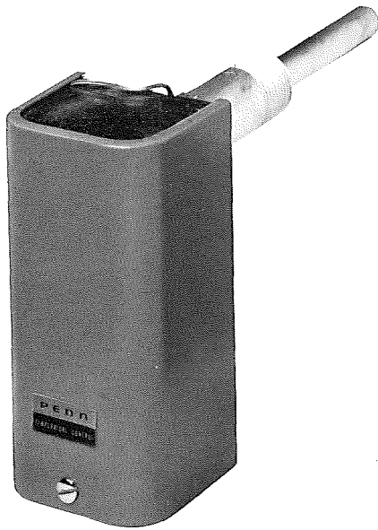
FIG. 70— Low Water Temperature Thermostat