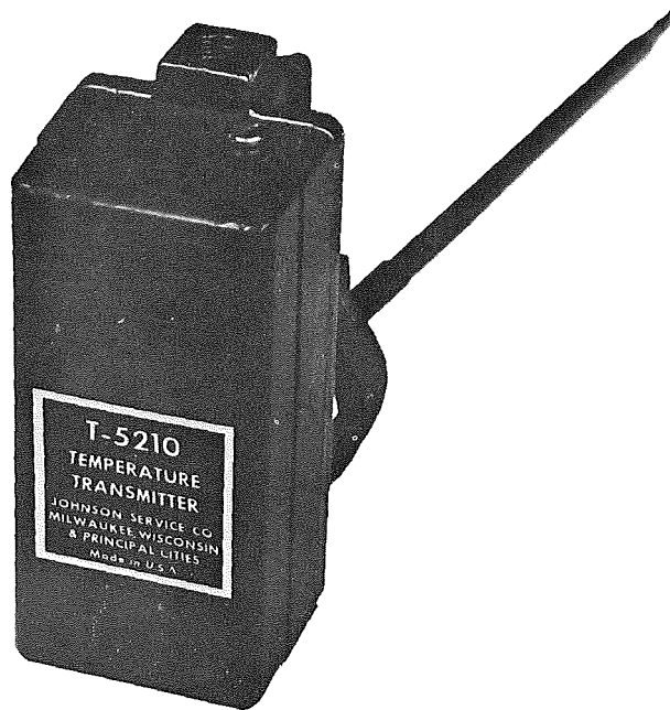
FIG. 10—LOW WATER TEMPERATURE TRANSMITTER PNEUMATIC PRV CONTROL UNITS ONLY